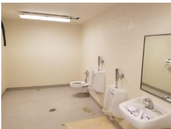
Painting Washington Level Locker Rooms