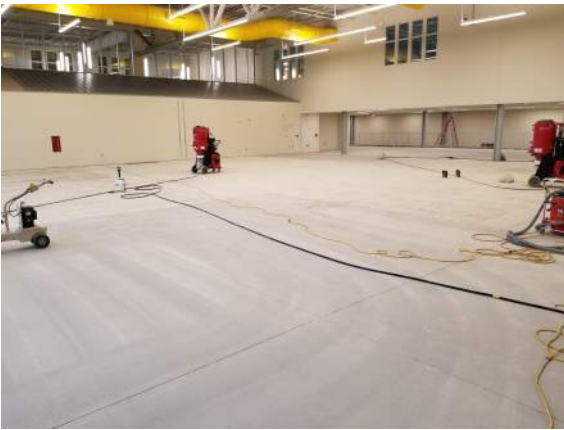
Prepping Dining Commons Floors for Polish