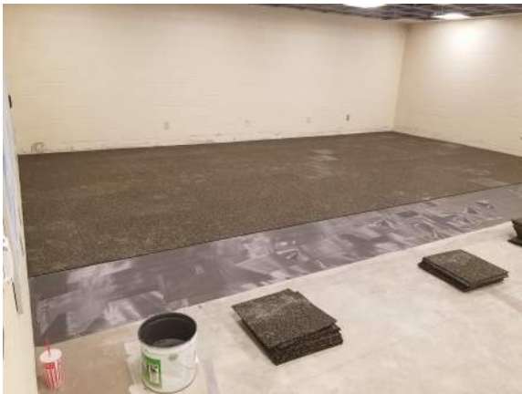
Flooring Washington Level Health Classroom/ Cardio