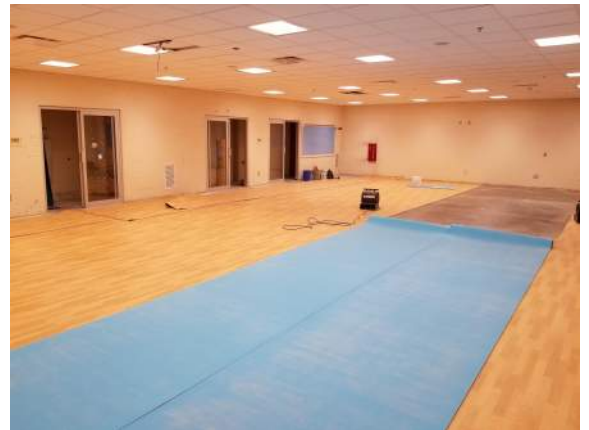
Flooring Washington Level Multipurpose Room